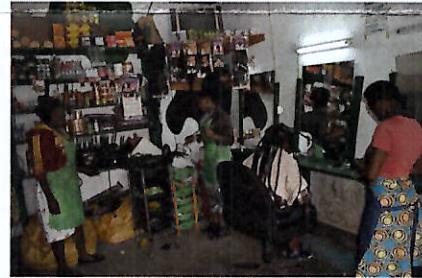
A new hope.

In Rwanda, COVID-19 is still influencing the lives of the children, young people and families that we support. The situation changes regularly and we are doing our very best to make sure that the children, young people and families stay healthy. We follow official guidelines to make sure they can continue to grow and develop, and can continue to go to kindergarten, school or training and take part in other activities. Enjoy your reading other updates.