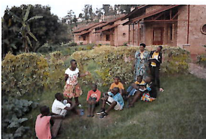
On the way to greatness.

Solange is one of them. She dropped out of secondary school due to early pregnancy.