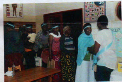
Children from surrounding community learning ITC in SOS Herman Gmeiner school in the village.

Within a changing environment, SOS Rwanda will continue to adapt its activities to best meet the need of vulnerable children at critical moments in their lives. We have started a new project which provides care for street children. We provide them with a home, schooling and medical care so that they become used to a stable way of life again. We also continue to support vulnerable families in the community and to run the kindergartens, schools and medical centres.